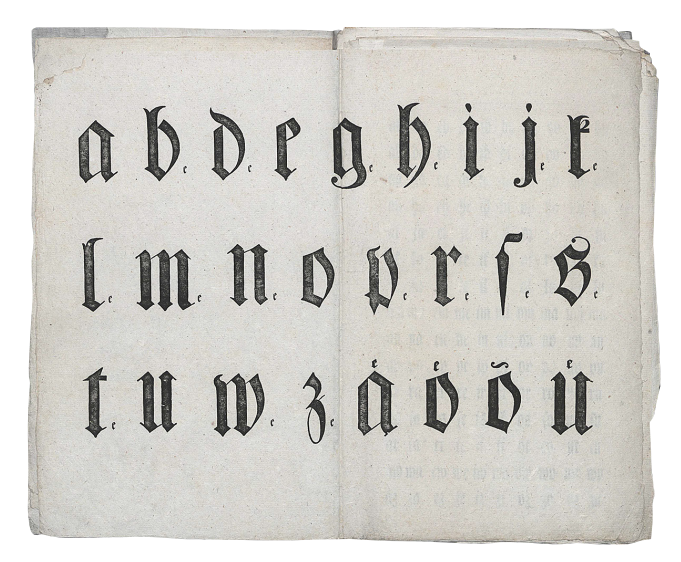
Figure 3. The lower-case alphabet (consonants with unpronounced e) from O. W. Masing's reading sheets (1821).

were a success. The reading cards make even the most phlegmatic ones think, because the students like the idea that they are producing something. Masing emphasised: "My method is not Lancaster's method, but my own; even if the two systems sometimes overlap, it only means that both of us have independently reached the same conclusions, and this also proves that this is a natural learning method." Masing confirmed that the work was quick and thorough, and he hoped that more than half of the students would be able to read quite well in three weeks. 90