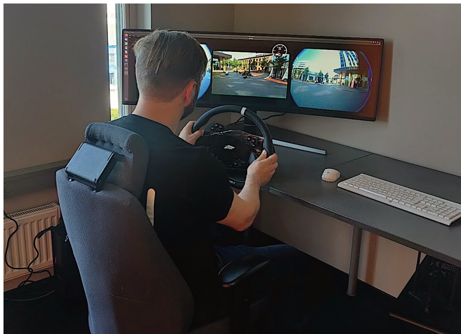
Fig. 2. Teleoperation in Ülemiste remote operation station.