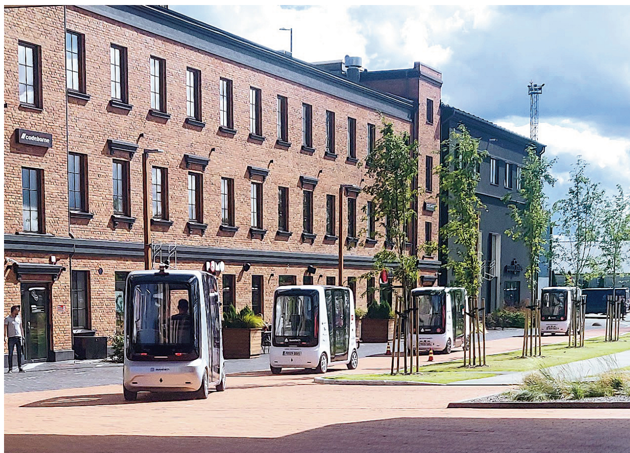
Fig. 3. iseAuto AV shuttle deployment in Ülemiste City.

But the pilot project did feature one (and the first) major traffic accident, which taught first and foremost communication skills and that a predetermined action plan had to be adopted between the partners for all occasions – also risk management with a clear communication plan in unexpected situations. The accident was not caused by technical issues or the autonomous shuttle's safety operator. In fact, he could not expect it as the accident was