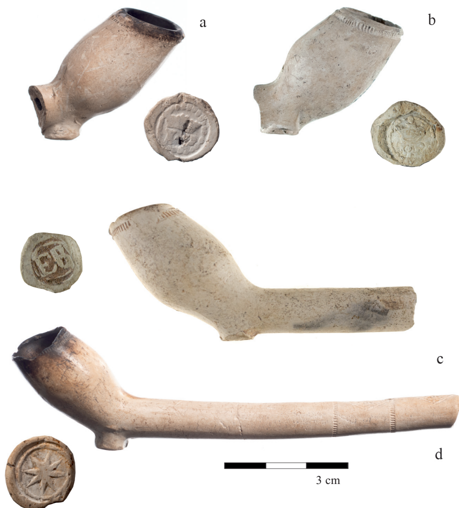
Fig. 2. Fragments of Dutch pipes. a, b – biconical bowl, heel mark crowned IP, 1640–1660 (a), 1635–1660 (b), found in the castle complex, c – biconical bowl, heel mark EB, 1645–1665, found in Didžioji St. 7, d – biconical bowl, heel mark star, stem with fleur-de-lis, 1645–1665, found in the castle complex. Makers marks are twice life size.

probably used by master Jakob Pietersen from Hoorn or Enkhuizen in the West Friesland. Both pipes are quite similar in size and shape. Their height is 41–42 mm, width at the heel, middle and rim – 13–14, 20 and 15–17 mm, respectively. The crown above letters IP looks slightly different. According to the available data, they could have been manufactured in 1635–1660 (Oostveen 2019, 16–18, 32, 33, 39, 50, 51, 54). Pipes with such markings are the most common among marked pipes in the city of Riga (Reinfelde 2005, 53). The geography of distribution of these pipes is truly impressive. These pipes have been found in different parts of the