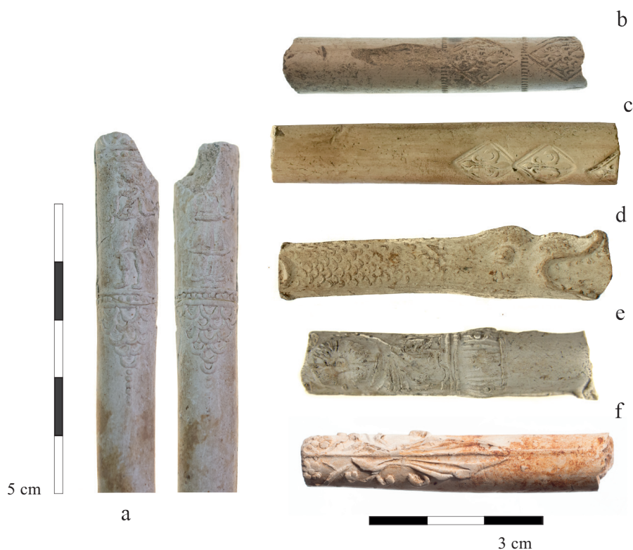
Fig. 3. Stem fragments of Dutch pipes with relief stamps. a – so-called “fiancé’s pipe”, 1630–1660, found in the castle complex, b, c – fleur-de-lis, 1625–1675, found in Basanavičiaus St. 15, castle complex, d – Jonah pipe, 1630–1660, found in Bokšto St. 6, e, f – baroque style pipes, 1630–1660, found in the castle complex.

Seven stems are decorated with the motif of the Prophet Jonah and the Whale, already described above (Fig. 3: d). If the bowl depicted the head of the prophet, then the stem would act as the whale. The fragments found are quite small, in some cases only fish scales are visible, and fish jaws can be seen in some of the stems.