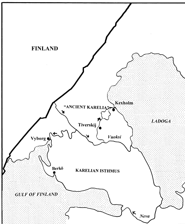
Fig. 2. The location of Vyborg on the Karel'ian Isthmus. The arrows mark the flow of the Vuoksi and Neva rivers in the Middle Ages. The eastern mouth of the Vuoksi River opened in 1867.

Joon 2. Viiburi asend Karjala maakitsusel. Nooled tähistavad Vuoksi ja Neeva jõe suunda keskajal. Vuoksi jõe idapoolne suue avanes 1867. aastal.