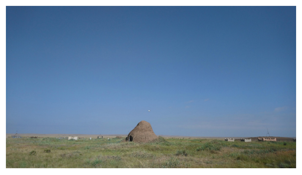
Figure 5. Mausoleum of an unknown person. Early Iron Age, Hunno-Sarmatian Stage. Dosmurzinov R. K. Yesil archaeological expedition to the Zhaksy district of Akmola region, Baubek batyr village, June of 2021.