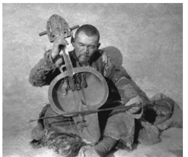
Figure 1. Kazakh shaman. Second half of the 19th century. Peter the Great Museum of Anthropology and Ethnography of the Russian Academy of Sciences