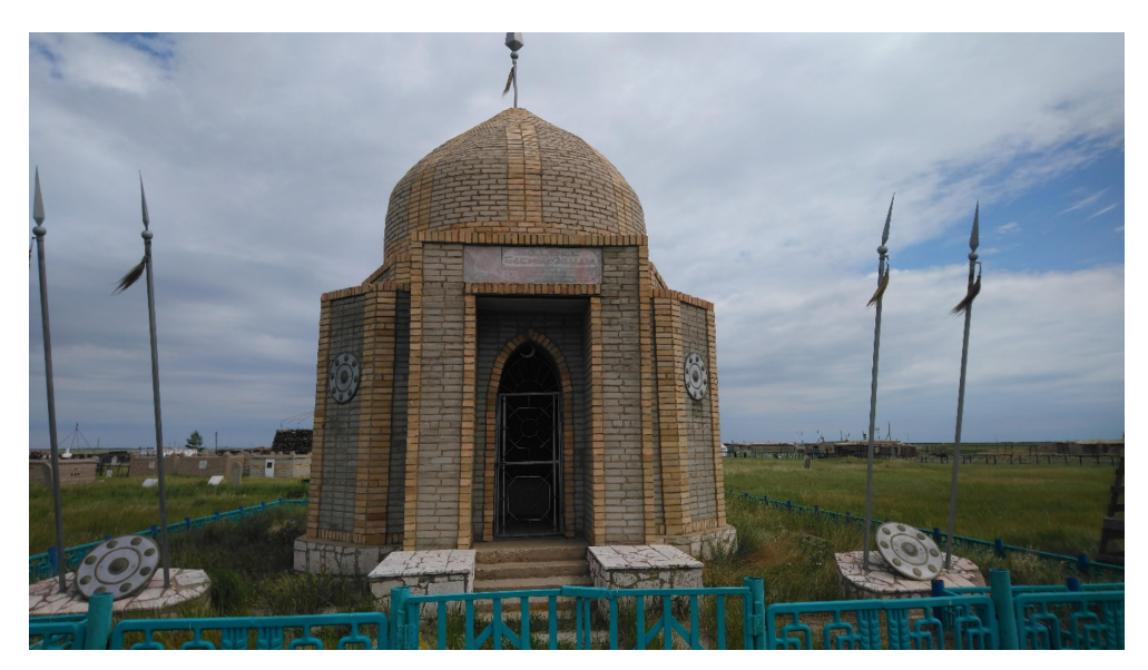
Figure 4. Mausoleum of Baubek batyr Bekmyrzauly. Dosmurzinov R. K. Yesil archaeological expedition to the Zhaksy district of Akmola region, Baubek batyr village, June of 2021.