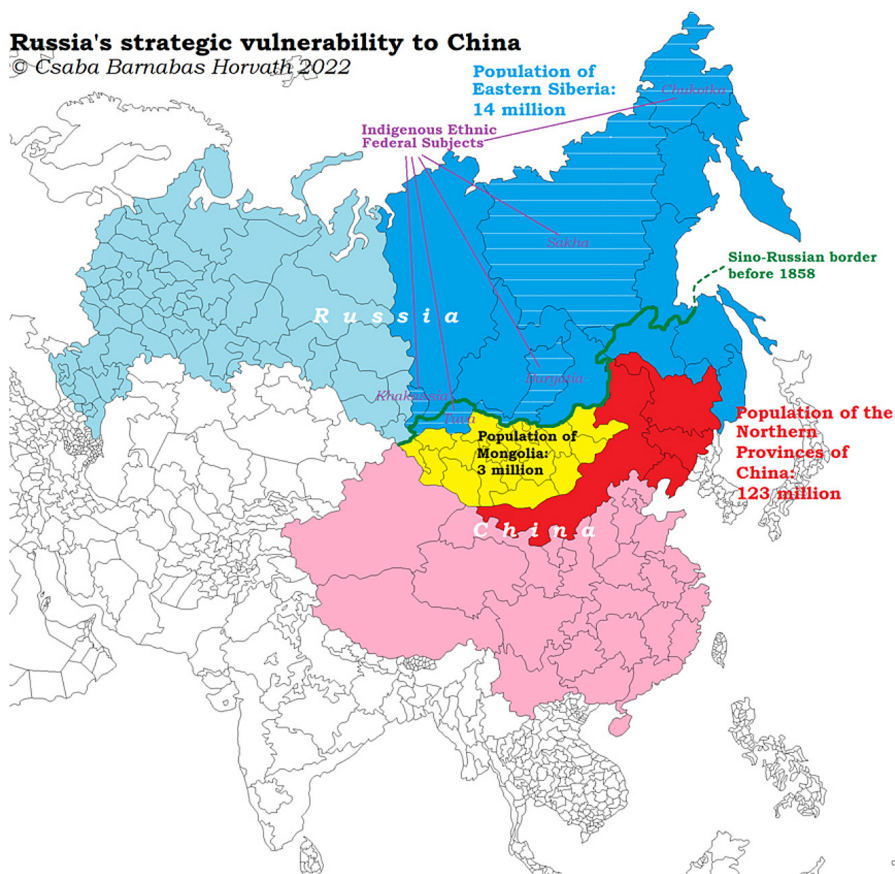
Figure 3. Source: Csaba Barnabas Horvath, “Was China betting on Russian defeat all along?” Geopolitical Monitor , April 25, 2022.