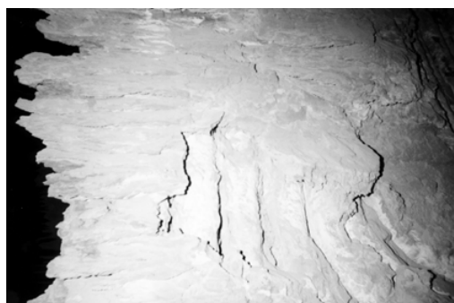
Fig. 1. Hard deposits on superheater II, boiler No. 23, Baltic Power Plant

The Estonian partners shared their information on formation of severe hard deposits and chlorine corrosion in pulverized-fired boilers. Familiarity with the problems was gained during the visit of the boiler No. 23 at Baltic Power Plant, in January 1994 (Fig. 1).