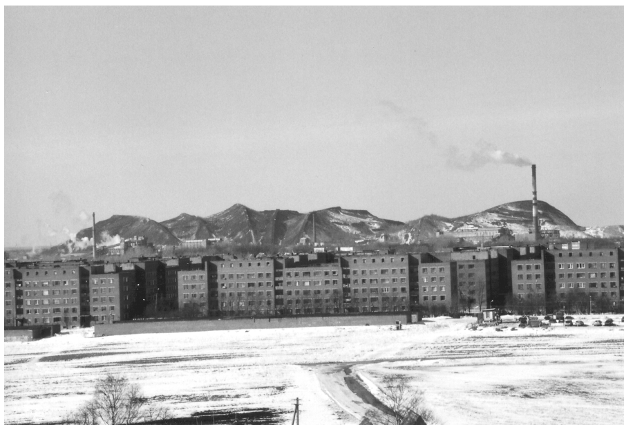
Fig. 3. Kohtla-Järve semi-coke mountains, known as North-East Estonian Central Ridge. The highest summit is the third from left (relative height 122 m)

There is a datum mark of 126 m above sea level at a knoll on the northern slope of old mountain of Kiviõli. The top of the knoll raises 79 m above the surrounding terrain and lies about 20 m lower from the top of the mountain itself. During the planning of a proposed ski centre on the old mountain in 2004, the relative height measured with GPS was 96 m. In summary, the relative heights of Kiviõli semi-coke mountains are 96 and 116 meters, respectively.