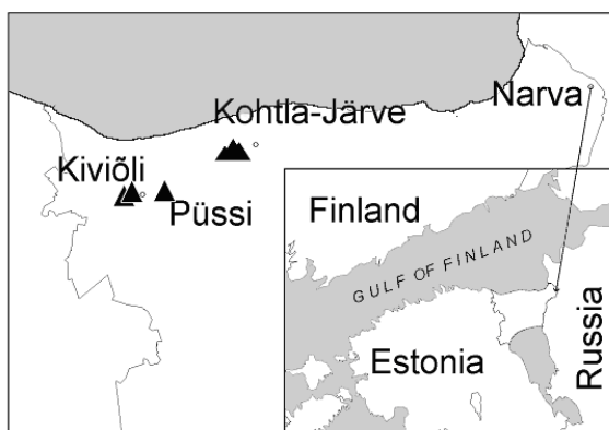
Fig. 1. Study area in Ida-Viru County

Most of the artificial landforms of oil shale industry lie in the north-eastern Estonian Plateau (Fig. 1) [5]. Quaternary deposits, the thickness of which is mostly less than 2 m, cover the limestone bedrock in this landscape region. The absolute height of the generally flat plateau reaches 30–50 m above the sea level, making the artificial landforms of oil shale industry conspicuous landmarks in the surrounding. The western ones lie near the town of Kiviõli, while the eastern ones are situated south from the town of Narva. Such landforms with similar origin are also found near the town of Slantsõ in Russia. Industrial mining of oil shale in Estonia began in 1916, and the total output has reached at 850 million tonnes by today.